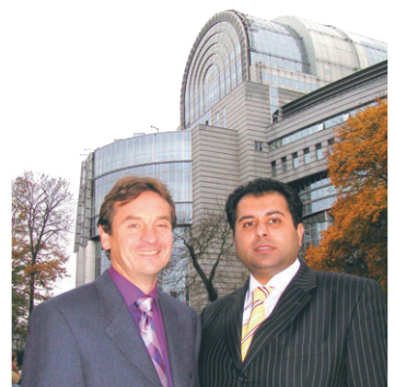
Rochdale Euro MPs