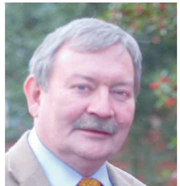
Lib Dem Council Group Leader