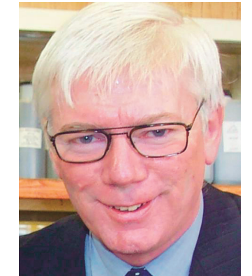
MP for Rochdale